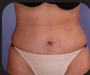
After: Adominoplasty with repair to the abdominal wall muscle