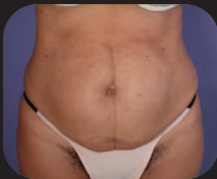
Before: 35 year old excess abdominal skin, fat and muscle laxity