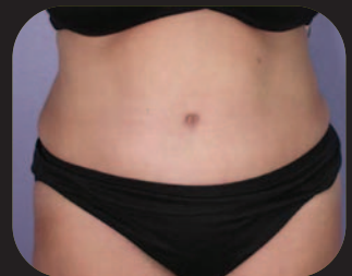
After: Adominoplasty with repair to abdominal wall muscles and liposuction