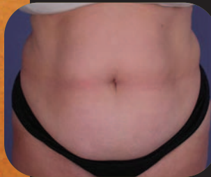
Before: 46 year old desired improvement in her abdominal contours